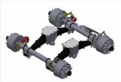
Heavy duty bogey axle, ideal for rough terrain