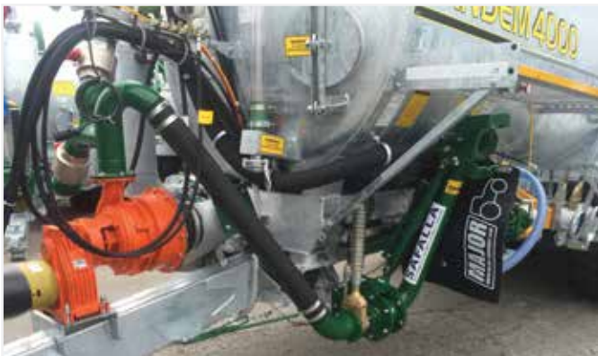
Doda Pump (with arm for umbilical systems)