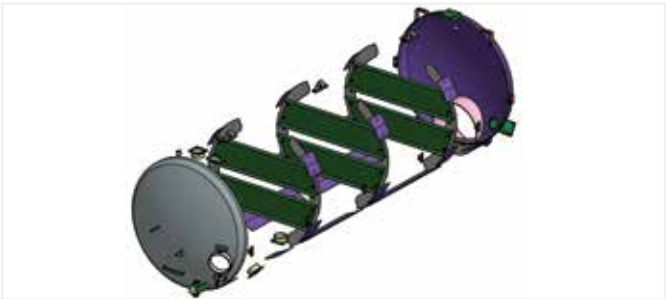
Internal baffle plates improve operator driver safety by preventing wave motions during transport.