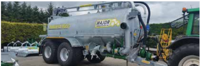
Fully galvanised finish