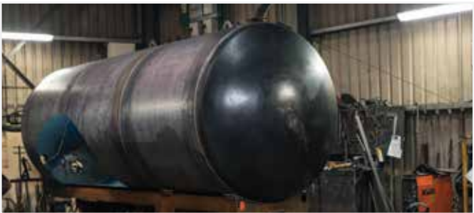
The joints on the tank are welded to ensure a high-quality and visually perfect weld seam.