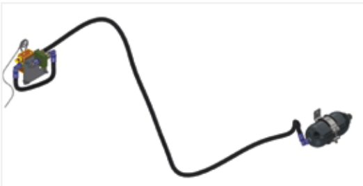
Fitted with safety breakaway cable for safer use on public highways.